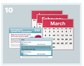
They will book your next appointment for about 12 weeks time